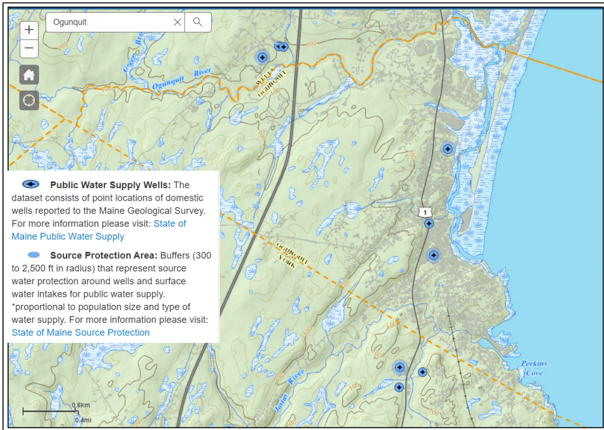
Map 3 Public water supply wells and source protection areas in Ogunquit.

The KK&WWD complies with federal and state regulations requiring routine monitoring for chemical and microbiological contaminants. KK&WWD performs over 15,000 water quality analyses through online instruments and grab samples each year, greatly exceeding the number necessary for compliance. Water quality is examined at the source(s) of supply, throughout the treatment process and ultimately at the consumer's tap. Alkalinity, pH, iron, disinfectant concentration, disinfection byproducts, lead, copper, fluoride, and turbidity are parameters routinely monitored in the distribution system.