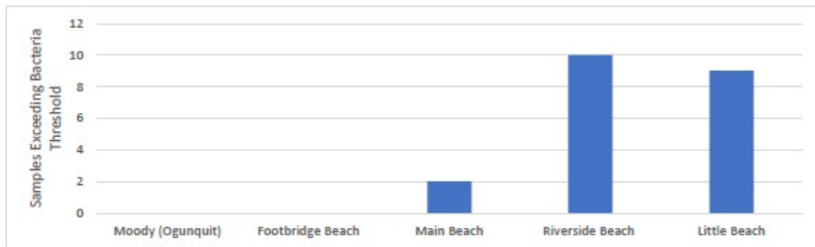
Figure 1 Maine Healthy Beaches 2021 sampling events exceeding the Enterococcus Beach Action Value (104 mpn/100mL) for beaches in Ogunquit. Data courtesy of Maine DEP Maine Healthy Beaches Program. (Source: Chart and caption: 2021 Water Quality Monitoring Report, FB Environmental Associates)